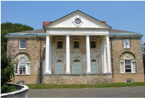
Historic Woodlands Mansion

Historical Archaeology Program Department of Anthropology College of William and Mary