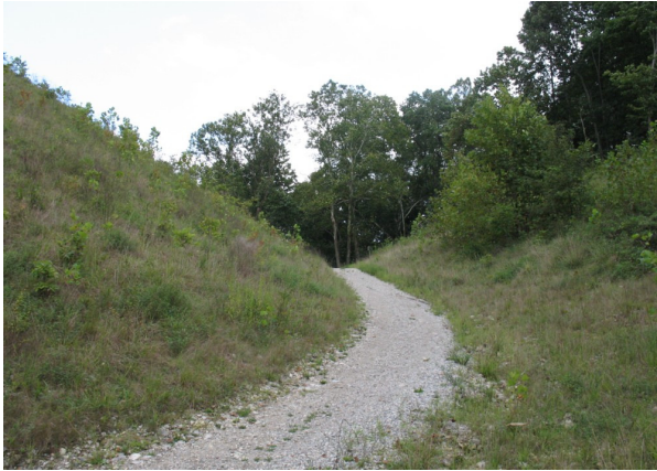
Cumberland Gap - The 'Saddle' ( http://www.sitemason.com/files/er4ZnW/cumgap2.JPG )