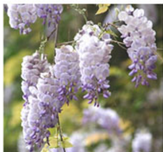
Wisteria ( http://blog.munawarali.com/wisteria-is-never-better-than-blue-moon/ )

The Natural History of Philadelphia in the 1800's.